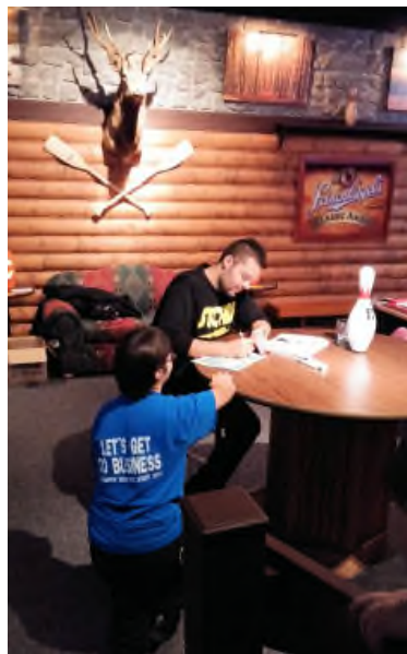
Jason Belmonte signing autographs.